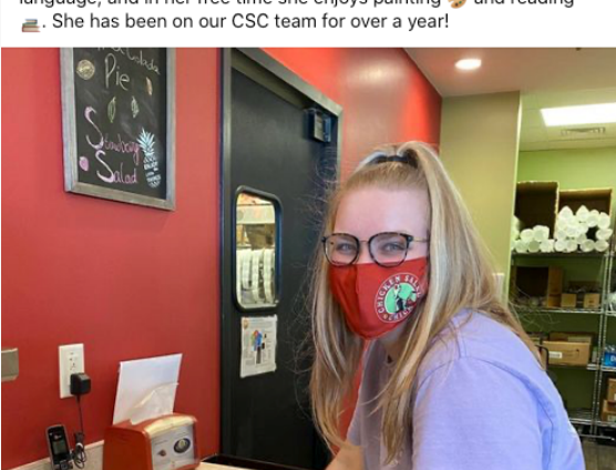
It's National Coffee Day! How do you take your coffee? Hot? No cream? Fancy? Bring on the iced latte?

#NationalCoffeeDay #APEXFinancialSolutions #taxconsulting